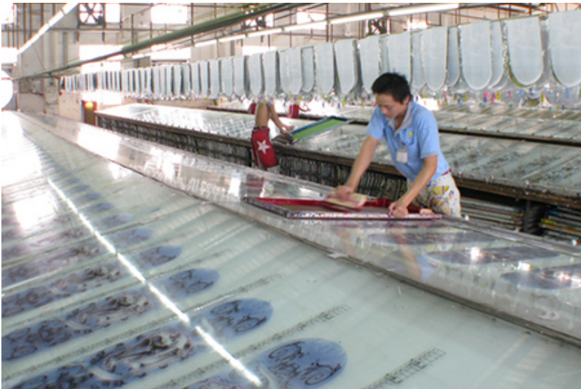
Printing Transfer Sheets

Heat transfers are hand silk screen printed onto a carrier plastic sheet on a flat glass table in the reverse colour sequence. The transfer sheets are then lined up over the board as it is passed through a big, very soft, heated silicone roller that conforms to the board's curves and basically melts the graphics onto the board's base. The plastic backing sheet is then peeled off and the edges are trimmed around using a sharp blade.